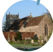
ST MARY'S Saltford

On the second Tuesday of every month I'm in St Mary's hall from 0930 - 1130