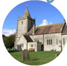
ALL SAINTS Corston

On the second Tuesday of every month I'm in St Mary's hall from 0930 - 1130