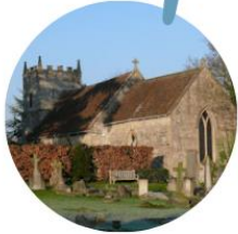
ST MARY'S Saltford

On the second Tuesday of every month I'm in St Mary's hall from 0930 - 1130