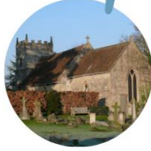
ST MARY'S Saltford

On the second Tuesday of every month I'm in St Mary's hall from 0930 - 1130