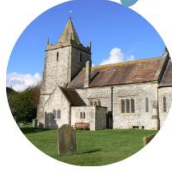
ALL SAINTS Corston

On the second Tuesday of every month I'm in St Mary's hall from 0930 - 1130