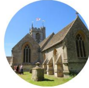
HOLY TRINITY Newton St Loe

On the first and third Wednesdays of every month I'm at All Saints coffee morning from 1030 - 1200