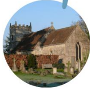
ST MARY'S Saltford

On the second Tuesday of every month I'm in St Mary's hall from 0930 - 1130