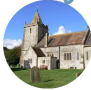
ALL SAINTS Corston

On the second Tuesday of every month I'm in St Mary's hall from 0930 - 1130