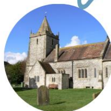
ALL SAINTS Corston

On the second Tuesday of every month I'm in St Mary's hall from 0930 - 1130