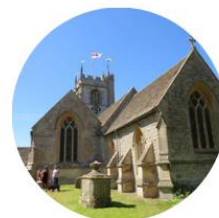
HOLY TRINITY Newton St Loe

On the first and third Wednesdays of every month I'm at All Saints coffee morning from 1030 - 1200