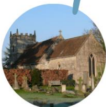
ST MARY'S Salford

On the second Tuesday of every month I'm in St Mary's hall from 0930 - 1130