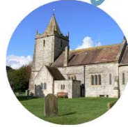
ALL SAINTS Corston

On the second Tuesday of every month I'm in St Mary's hall from 0930 - 1130