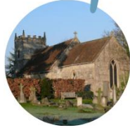
ST MARY'S Salford

On the second Tuesday of every month I'm in St Mary's hall from 0930 - 1130